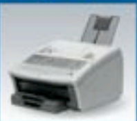
Plain Paper Laser Fax