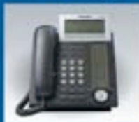
Business Telephone System