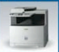
A4 Color Multifunction