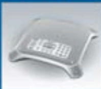
IP Conferencing Phone